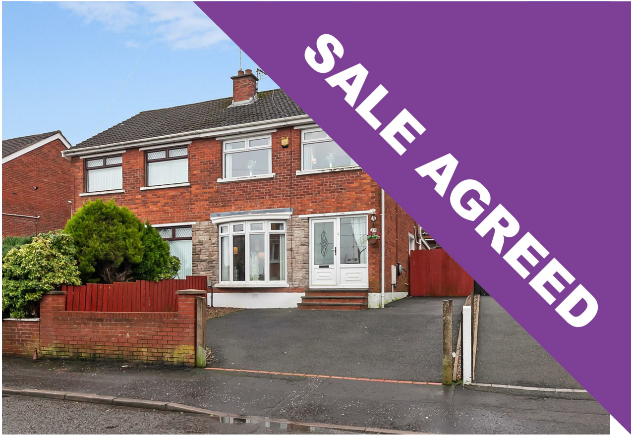
88 Ferndale Road, Newtownabbey, BT36 5AS